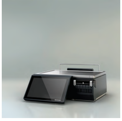
XC 100 - Price Computing Scale

The open PC platform offers sufficient capacity to cope with new features or customer-specific requirements in the future. Even the use of 3rd-party software presents no problems. The 'all-purpose' printer is unique to the market and can perform every conceivable printing task that can be required of a weighing device. Furthermore, replacing the paper roll is a very brief and intuitive process, and daily cleaning of the scale can be carried out quickly and easily. This is supported by each scale's compact design, the easy clean surface of the housing and the newly developed, frameless easy clean display.