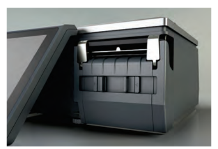
Easy load printer

Plus many more software options for additional solutions.