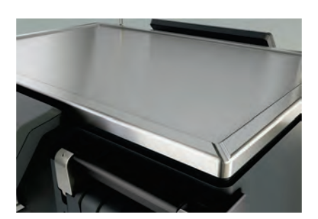
Easy clean load plate